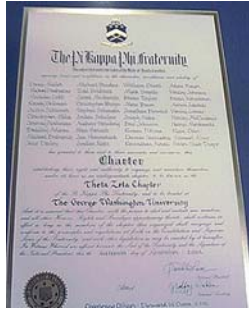
Theta Zeta's Charter was received on November 16, 2002