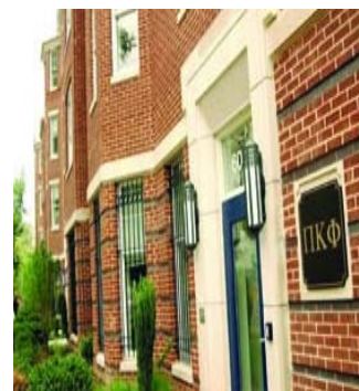
Pi Kappa Phi house overlooks 23rd St.

Fraternity house have traditionally been the foundations in which a truly strong brotherhood is built. The first fraternity house was the Chi Psi house at the University of Michigan in 1854, and since then fraternities have been able to take advantage of a house to focus their contributions to campus activities and campus social life.